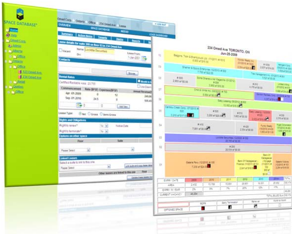
Lease reports clarify the complexities of multi-tenanted buildings.

While Tenant Dashboard streamlines the day to day activities of leasing professionals, it is also designed to support the needs of asset managers who deal with multi-tenanted office and industrial properties. It uses lease information combined with area data to deliver summary performance reports that are of particular interest to financial analysts, senior managers and investors.